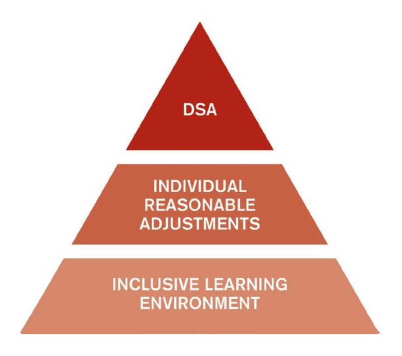
Figure 1: Supporting disabled students in HE

Inclusive learning refers to the way that teaching and learning materials and approaches are designed and delivered to engage all students (Hockings, 2010). HE providers are required to offer an inclusive learning experience to all students, based around a social model of disability. The Department for Education (DfE, 2017) have proposed a model to show how HE providers should structure their support for disabled students (Fig 1.).