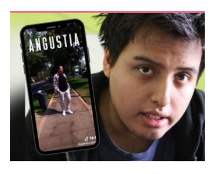
My Story — 08.06.22 THE VALUE OF STAMMERING IN FILMMAKING