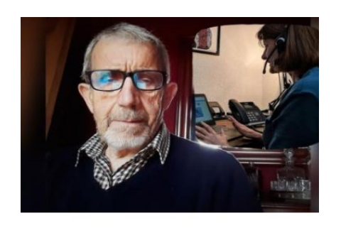
Opinion — 16.05.22 HOW MANY PEOPLE WHO STAMMER EXPERIENCE SUICIDAL THOUGHTS?