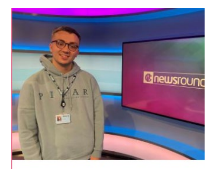
Work & Job Hunting — 29.04.22 LANDING MY DREAM CAREER IN TV